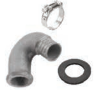
Vacuum Brake components