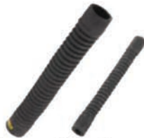
Vacuum Brake Hose To any required size