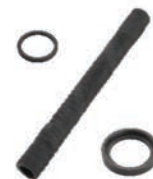
Steam Heat components