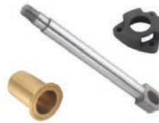
Huge selection of Vacuum Cylinder components