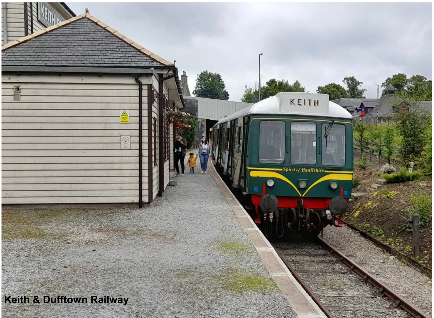
Keith & Dufftown Railway

A Single Source Solution – www.heritagesteamsupplies.co.uk