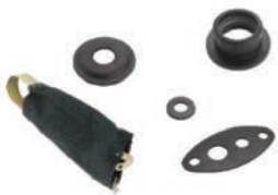
Overhaul kits for all sizes of Vacuum Cylinder & Associated Valves

Introducing our expanding range of carriage and wagon components